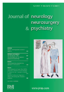
Miniature from Guido de Vigevano's work on anatomy showing trepanation