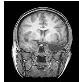
See p 593