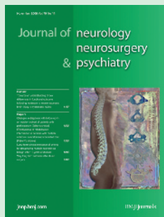
Cover image: Types of vertebrae viewed from above