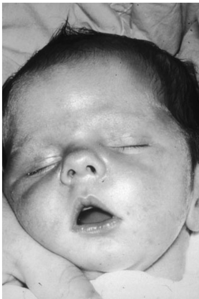
Figure 2 The typical tented upper lip ('carp mouth') appearance in congenital myotonic dystrophy.

The diagnosis of DM1 is made from DNA testing in an individual who is clinically suspected to have DM1. Non-molecular testing has been used in the past to establish the diagnosis of DM1 but now has no role in making the diagnosis in current practice. Patients may have had an EMG and occasionally a muscle biopsy and other tests before the diagnosis was clinically suspected. It is therefore valuable to be aware of the features of these investigations in patients with DM1. It should be emphasised that there is no clinical indication for performing a muscle biopsy to make the diagnosis of DM1. If the clinical features suggest DM1, but DM1 genetic testing is negative, then DM2 testing should be performed.