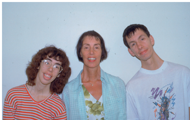
Figure 5 A mother with DM1 in centre (approximately 230 CTG repeats) with her affected daughter on the left (approximately 630 CTG repeats) and affected son (approximately 730 CTG repeats). The son and daughter have expanded repeats compared with their mother due to anticipation through the maternal line.

Myotonia may interfere with daily activities such as using tools, household equipment or doorknobs. Handgrip myotonia and strength may improve with repeated contractions—'warm up phenomenon'. 28 The warm up phenomenon can also improve