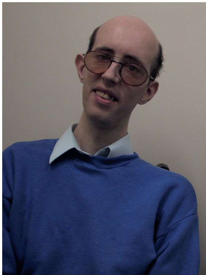
Figure 4 Patient is eldest son of patient in figure 3. He has congenital onset myotonic dystrophy and already shows similar features to his mother and frontal balding (approximately 1300 CTG repeats). Unfortunately, his younger brother (approximately 1500 CTG repeats) died suddenly and this was presumed to be secondary to a malignant cardiac arrhythmia.

The predominant symptom in classic DM 1 is distal muscle weakness, leading to difficulty with performing tasks requiring fine dexterity of the hands and foot drop, particularly affecting ankle dorsiflexors. The characteristic facies is caused by weakness and wasting of the facial, levator palpebrae and masticatory muscles giving rise to ptosis and the typical myopathic or 'hatchet' appearance (figures 3–5). The neck flexors and finger/wrist flexors are also commonly involved. Ophthalmoplegia is described but is rare. Muscle weakness progresses slowly. An axonal peripheral neuropathy may add to the weakness. 23